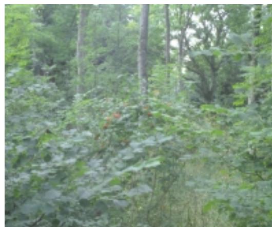
In close to nature forestry natural regeneration is preferred to planting. This is seen as less disruptive than clearcutting, at least in the nemoral parts of Europe.

From the historical background outlined in this article, it could be questioned whether the rise of interest in close to nature forestry during the last 20 years is just another temporary peak, as have occurred during previous centuries.